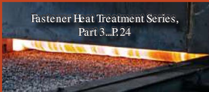
Fastener Heat Treatment Series, Part 3...P.24

Spotlights: Simulation...page 29 Plastic Fasteners...page 73